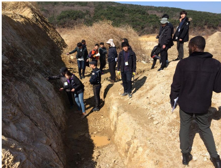
Field investigation of trench in Gyeongju (March 17 th 2018).

IUGS TGG continues to contribute to mapping of active faults and tectonic interpretation by providing geological and geophysical information, remote sensing images and our experiences.